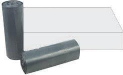
Can Liners 33 gallon