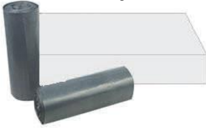
Can Liners 15 gallon